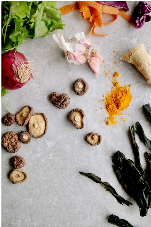
Gut Healing Vegetable Broth