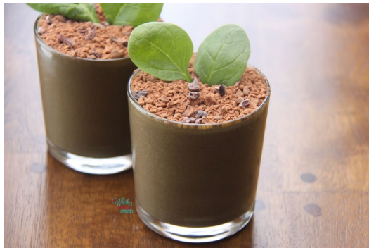
Eat Dirt Green Protein Shake