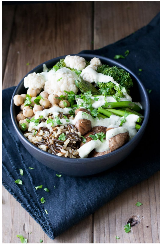
Veggie Rice Buddha Bowl w/Lemon Herb Sauce